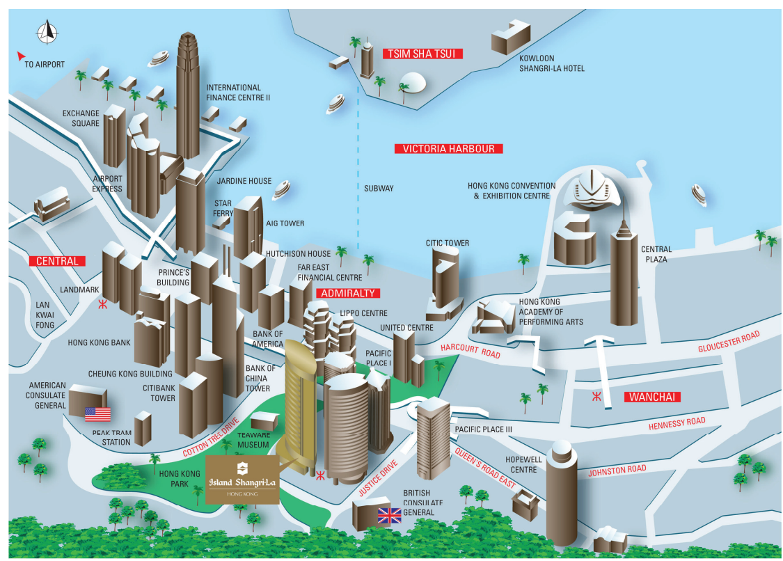
X MTR STATION