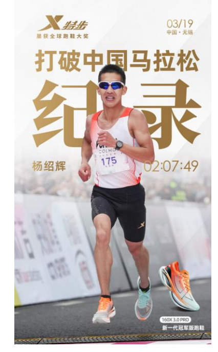
Yang Shaohui broke the national marathon record with a time of 2:07:49

Since 2018, the world-renowned "160X" running shoes series has repeatedly entered the international stage. Xtep has continued to increase investment in research and development, polish and innovate, focus on the technologies and product equity of the running shoes. Since its debut, the "160X" series has been continuously advanced and redeveloped to expand its matrix to cover multiple scenarios, including racing, training and amateur running to meet the demand of runners with different abilities. In September 2022, Xtep launched the "160X 3.0 PRO", the new-generation running shoes under the "160X" series.