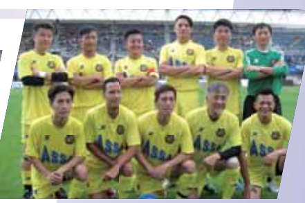
Hong Kong All Star Sports Association