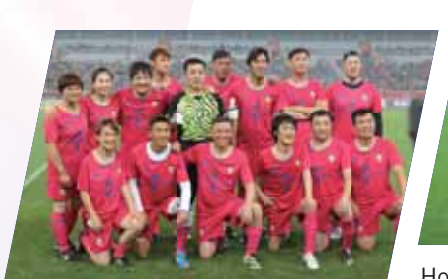
China All Star Football Team