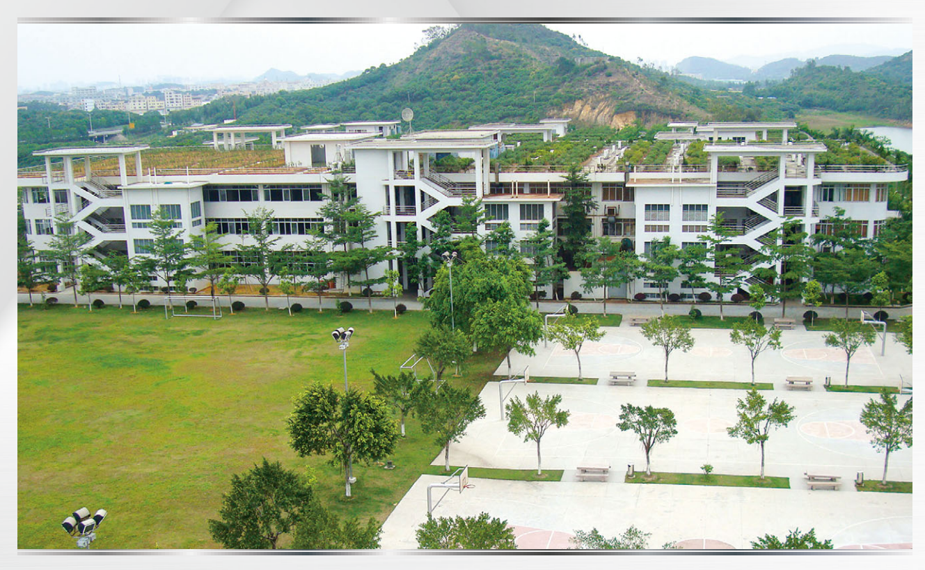
The Dongguan Dalang factory