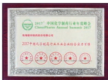
Zhuhai Company - 2017 China Pharmaceutical Industry Top 100 (Overall Power) Industrial Enterprise