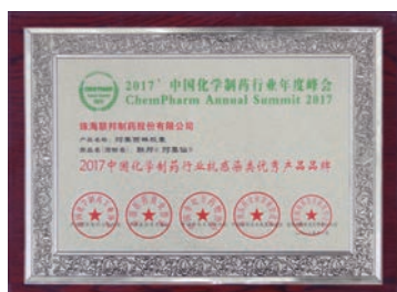
Zhuhai Company - 2017 China Pharmaceutical Industry Anti-Infective Products Outstanding Brand

In the Year, the Quality Inspection Center of the Group's manufacturing base in Zhuhai has obtained the recognition of the China National Accreditation Service for Conformity Assessment (CNAS) for the third times, as well as received the honorable title of the "National 1st May Female Model Position". Besides, the products of the Group, including the insulin bulk medicine, penem-type preparations, Memantine Hydrochloride and penem-type antibiotic bulk medicine received the "Promotion Catalogue Certificate of Key Products of Strategic Emerging Industries in Zhuhai City", which was a major proof of the high-quality manufacturing of the Group. Under the high-level, high-requirement quality control, the Group has obtained multiple awards and honors, for example, the Zhuhai Manufacturing Base received many honorable titles, including the "2017 China Pharmaceutical Industry Top 100 (Overall Power) Industrial Enterprise", the "2017 China Pharmaceutical Industry Bulk Drugs Export Enterprise Outstanding Brand", the "2017 China Pharmaceutical Industry Biochemical Products Outstanding Brand" and the "2017 China Pharmaceutical Industry Anti-Infective Products Outstanding Brand", which has greatly enhanced the good will and brand awareness of the Group.