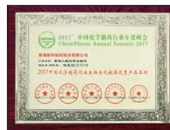
Zhuhai Company - 2017 China Pharmaceutical Industry Biochemical Products Outstanding Brand