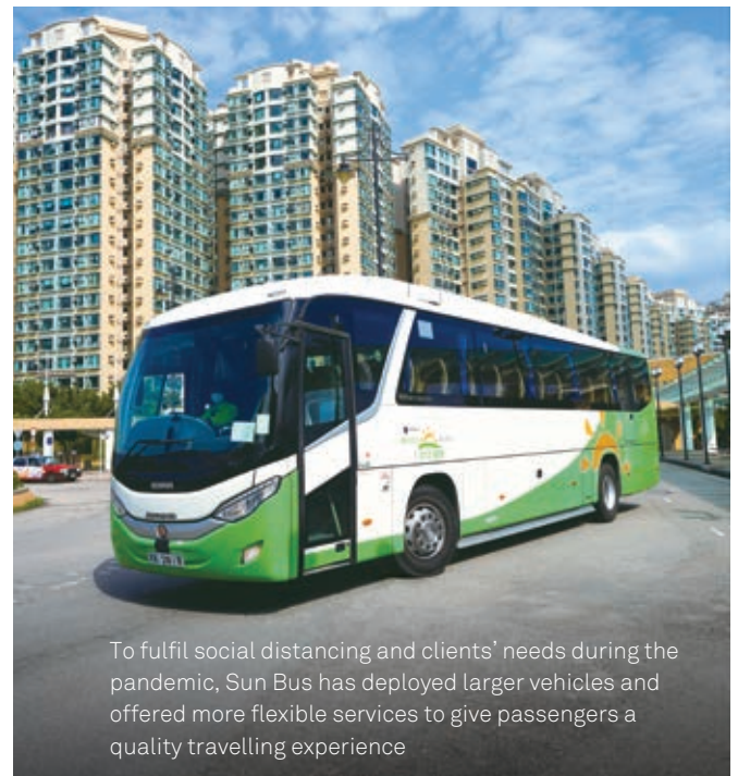
To fulfil social distancing and clients’ needs during the pandemic, Sun Bus has deployed larger vehicles and offered more flexible services to give passengers a quality travelling experience

By the end of 2021, the SBH Group had a fleet of around 400 coaches and had introduced five brand new Euro VI ultra-low-floor double-deck buses. To further enhance the service brand, the SBH Group will continue to purchase more electric vehicles and promote a wider application of technology.