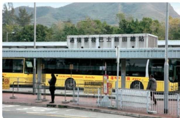
NHKB provides a service between Lok Ma Chau and Huanggang

NHKB jointly operates with its Shenzhen counterpart a direct, value-for-money, 24-hour cross-boundary shuttle bus service, known as the “Huang Bus”, catering to regular commuters and those travelling for leisure between Lok Ma Chau in Hong Kong and Huanggang in Shenzhen.