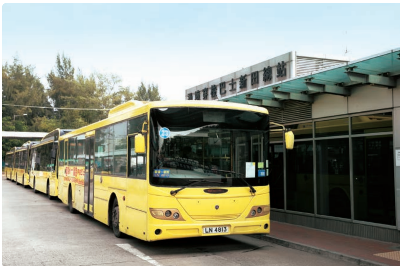
NHKB takes the strain out of cross-boundary travel

In 2018, NHKB operated a fleet of 15 air-conditioned super-low floor single-deck buses on its shuttle bus service between Lok Ma Chau and Huanggang. NHKB's terminus at the San Tin Public Transport Interchange boasts four comfortable air-conditioned boarding lounges and an integrated information display system.