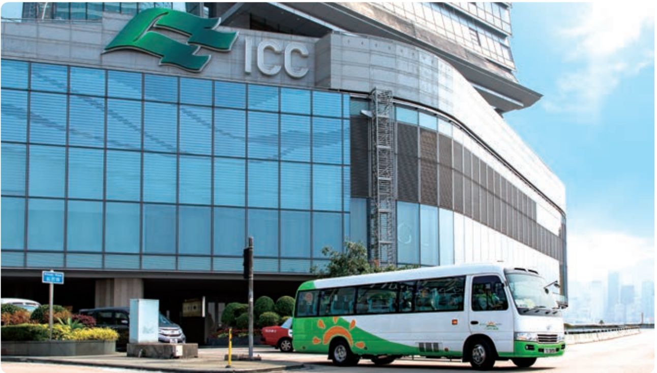
SBL provides services for business commuters

purchased 84 Euro V/VI buses for fleet replacement purposes. At the end of 2018, the SBH Group had a fleet of 390 buses. The SBH Group will continue its fleet upgrade programme through the introduction of more Euro VI buses and the wider application of technology.