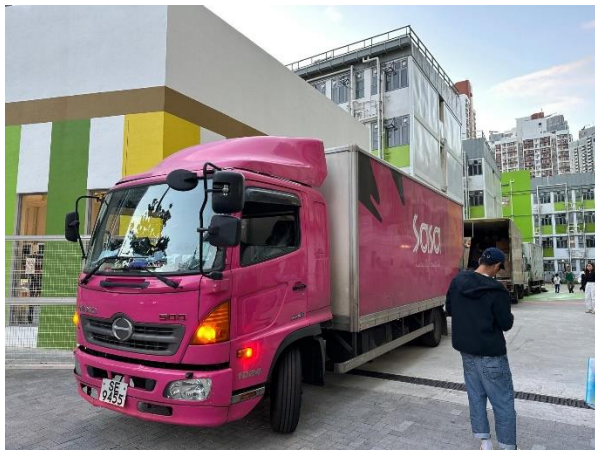
Our “Sa Sa Sincere Volunteer team” delivered in-kind support to the affected residents living in the transitional housing of “Lok Sin Village” in Tai Po.