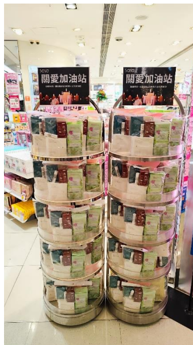
“Sa Sa Care Support Station” was set up in Tai Wo Plaza branch in Tai Po the next day of fire tragedy.