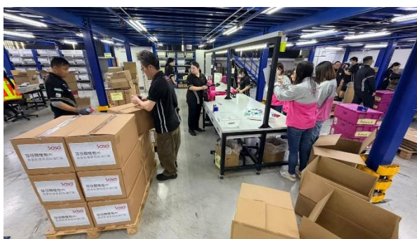
Our “Sa Sa Sincere Volunteer team” has been working tirelessly for days to prepare “Care Packages” and show our care to the affected residents in Tai Po.