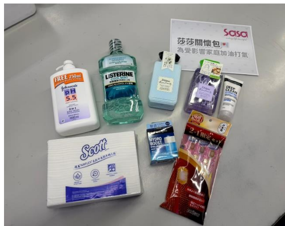
Sa Sa expresses sincere gratitude to the brand partners for their care and support to Hong Kong, enabling a timely delivery of in-kind support to the affected residents.