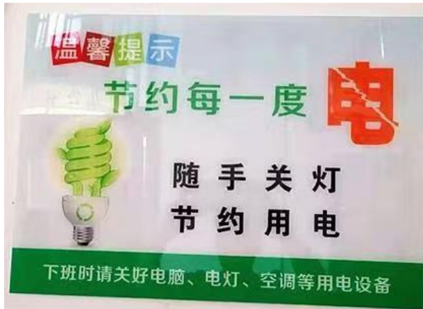
Save every kWh of electricity. Turn off the lights and save electricity