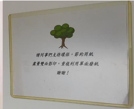
Dear colleagues, please support the environment and save paper. Use double-sided photocopying where possible and re-use single-sided wastepaper. Thank you!

The practices listed above have already made a big difference. The digitisation of paper use, and reuse and recycling of scrap paper, for example, have led to a significant reduction in paper usage. In 2023, both our Hong Kong headquarter and Guangzhou offices achieved a 100% reuse and recycling rate of scrap paper.