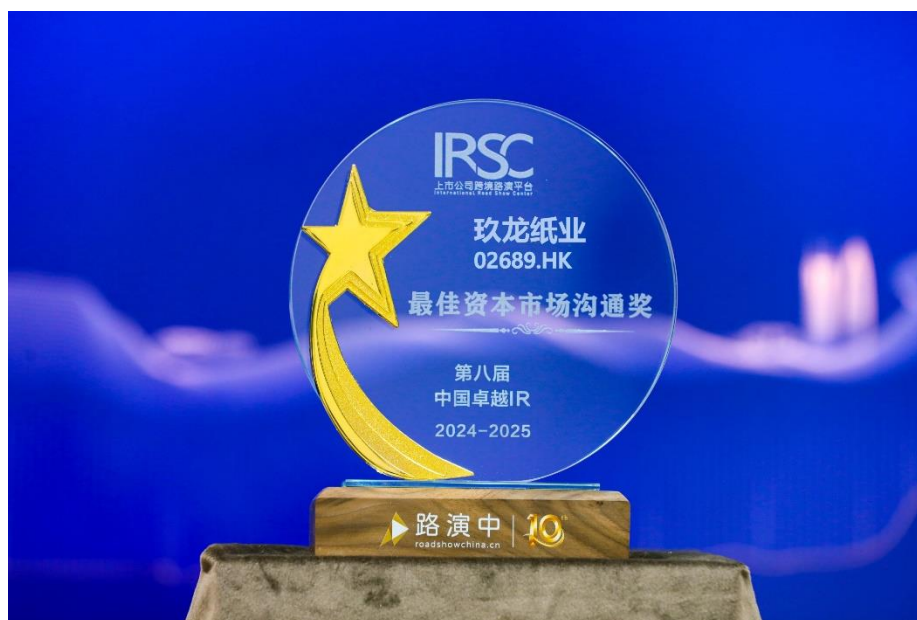
Nine Dragons Paper Won The “Best Capital Market Communication Award” for The First Time

Looking ahead, Nine Dragons Paper will further strengthen information transparency, deepen investor relations management and enhance quality communication with the capital market to facilitate positive relationship between the Company and its investors, and promote the Company's steady and robust development, continuing to create long-term value for investors and other stakeholders.