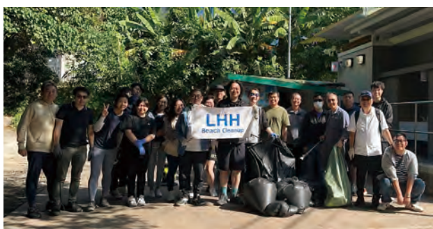
Beach Clean-up Activity 海灘清潔活動

During the Reporting Period, the Group took part in a beach clean-up activity organised by Environmental Protection Department with 19 employees taken part and have contributed a total of 38 hours to the activity. The Group also participated in the Caring "Inclusion" Joy Charity Walk 2023 and 37 employees have participated in the event. The Group's sponsorships and donations amounted to approximately HK$149,000 in total, for the purpose of supporting sports development, the construction industry in Hong Kong and low-income families in Hong Kong.