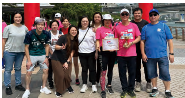
Caring "Inclusion" Joy Charity Walk 2023 關愛共融「健障行」慈善步行樂2023

於報告期間，本集團參與了環境保護署組織的海灘清潔活動，共有19名僱員參加，為活動貢獻合共38小時。本集團亦參加了關愛共融「健障行」慈善步行樂2023，共有37名僱員參加此項活動。本集團贊助及捐贈總額約149,000港元，用於支持香港的體育發展、建築業及香港的低收入家庭。