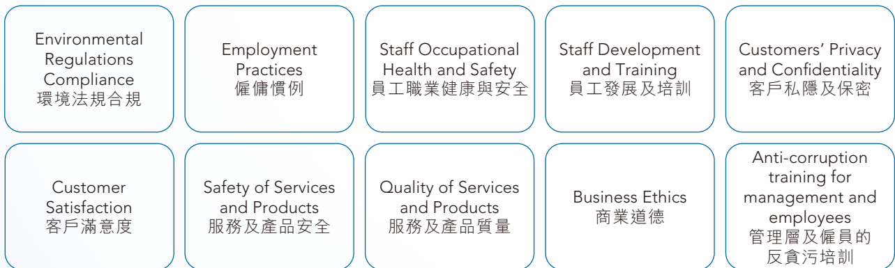
Materiality Matrix 重要性矩陣