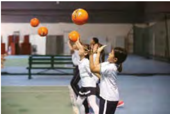
Sports experience of student visitors

The Group always values the communications with various primary and secondary schools as well as colleges. We welcome students who are interested in LI-NING brand and Li Ning Park to visit the Group's office park in groups. In 2018, the Group's headquarters park in Beijing received a total of 4,431 students from 11 schools, including Beijing Primary School, primary school affiliated to Peking University, Jiangtai Road Primary School of Chaoyang District, Baijiazhuang Primary School and Shibalidian Secondary School. The Group arranged volunteers to guide student visitors to look around the major venues of the Park. The students, under the guidance of the park coaches, had their on-site experience of various sports facilities at Li-Ning Centre. We expect that through continuous visits for primary and secondary school students, more teenagers can gain better understand of the Group as well as the sports industry and build up a passion for sports.