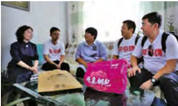
Home visit to impoverished mothers

In July 2018, the donation launching ceremony of “2018 Li Ning Company’s Charity Donation for Caring the Impoverished Women and Children — Postal Parcels for Mothers, a Visit to Inner Mongolia” was held in the new district of Hulunbuir. The Group donated supplies to the Women’s Federation in Inner Mongolia Autonomous Region via China Women’s Development Foundation. 60 mothers and 30 teenagers and children from Hailar District, Ewenki Autonomous Banner and Old Barag Banner accepted our donation at the ceremony. After the conclusion of the donation ceremony, China Women’s Development Foundation and the Group’s visiting team paid an in-depth home visit to 4 impoverished mothers in Bayantala, Ewenki Autonomous Banner. For the past six years since the launch of “Postal Parcels for Mothers” project, the Group has donated a total of RMB56.50 million (in cash or in kind) to the project.