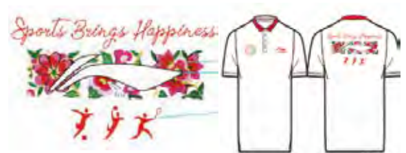
Design of charity sale products

In May 2018, the Chinese Athletes Educational Foundation, which is jointly initiated, sponsored and established by Mr. Li Ning, one of the initiators of Chinese Athletes Educational Foundation and our executive chairman, and world champions, joined hands with the Group to gather love and power for charity sale. All of the proceeds were used for sports charity events organized by the Chinese Athletes Educational Foundation including "All-weather Playground (風雨操場)" and "Unique sports exploration (不一樣的體育拓展)". Both the Group and the Chinese Athletes Educational Foundation have been committed to education development and construction of sports facilities in impoverished and remote regions in China. So far, we have established 44 "Chinese Athletes Hope Primary Schools" and 37 "All-weather Playgrounds" as well as supporting projects such as Project Hope Mini-Library and training for physical education teachers, allowing children in remote regions to feel the charisma of sports and develop strong body and sound personality.