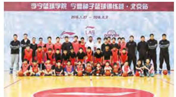
Li Ning Basketball Training Camp

In January and from July to August 2018, the Group organized 2018 Li Ning Winter Camp and Summer Camp, respectively, at Li-Ning Centre in Beijing. The participants include a total of 484 children and teenagers from various age groups, such as U12, U13, U15 and U17, who attended sports courses for basketball, football, table tennis and badminton offered by professional sports coaches. As Li Ning Winter/Summer Camp progresses over the years, more and more children and teenagers become inspired with sportsmanship and increasingly enthusiastic for sports through these events.