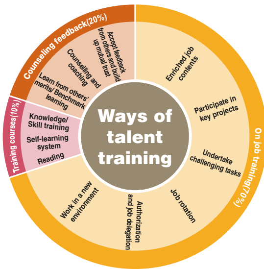
Diagram on the Group's talent training

In 2018, a total of more than 130,000 of the Group's staff in service participated in various training organized by the Group, with over 20,000 training hours in aggregate.