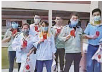
Voluntary blood donation in 2021

Faced with the pandemic in 2021, Ju Teng International took social responsibilities and provided materials for the frontline anti-pandemic personnel of the Group. At the same time, in the case of insufficient blood collection during the pandemic, employees donated blood for three times in May, June and December respectively, and took their practical actions to help fight against the pandemic. More than 190 employees joined the blood donation team in the Wujiang Production Plant alone, and the blood donation amount reached 60,000 ml.