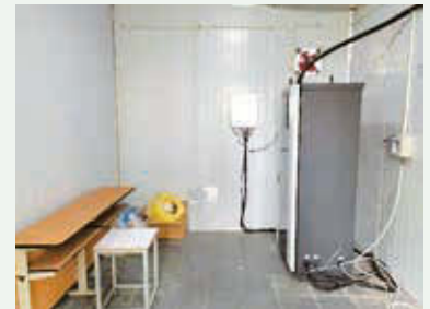
Waste gas emission monitoring station room

painting and spraying waste gas. Meanwhile, the Chongqing Production Plants have built a waste gas emission monitoring station room next to the existing boiler room waste gas emission chimney, and installed additional online monitoring equipment such as flue gas online analyser, dust meter, temperature-pressure-flow integrated machine, etc. to monitor the concentration of pollutants in the boiler emission in real time, effectively reducing the degree of impact on the atmosphere and the surrounding environment.