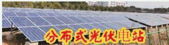
Distributed photovoltaic power plant

Ju Teng International always encourages each Production Plant to fully utilise its own advantages and resources to develop and build new energy projects such as photovoltaic power generation. During the Reporting Period, the Compal Production Plant continued to utilise the unused vacant land and roof of the plant for photovoltaic power generation. In 2021, 11,890 MWh of photovoltaic power was generated, saving 1,462 tons of coal equivalent. Clean electricity produced by photovoltaic power plants was used for the Company's production and operation, which reduces the purchased electricity and indirectly reduces the greenhouse gas emissions caused by thermal power generation, with a decrease in emission of 11,316 tons CO 2 .