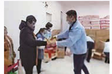
Distribution of necessities including rice and noodles at the end of 2021

In the future, Ju Teng International will continue to pay attention to the development of the community, make more investments in the community, and focus on the common development of the Group and the community where we operate.