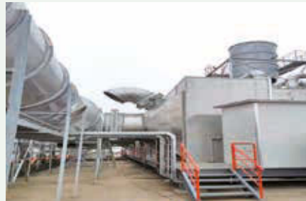
Installation of "zeolite rotor + RTO"