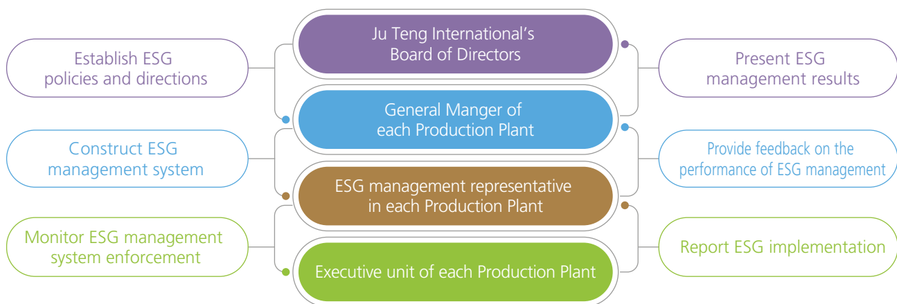
ESG Management Organisation Structure

The Board of Directors of Ju Teng International is taking the lead in formulating ESG management policies at the Group level. The general manager of each production plant company (“Production Plant”) is responsible for constructing the ESG management system that meets the characteristics of the Production Plant, participating in the top-level design, controlling the policies and systems of all ESG-related aspects, and reporting to the Board of Directors the Production Plant’s ESG management results. Each operational unit in the Production Plants is required to strictly implement the ESG management system, including executing the ESG targets, ESG training, managing ESG-related data and collecting information. The Group’s ESG management organisation structure is as follows: