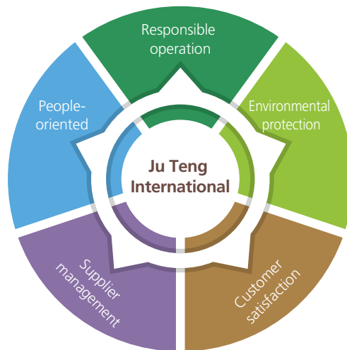
Ju Teng International's visions

Ju Teng always believes that quality, scientific management and sustainable development are the foundation. With the increasingly stringent requirements of governments and markets on the electronics industry's production chain over the past 21 years, we have won the recognition of our customers worldwide by relying on our advanced technologies, responsible attitude, professional services and excellent product quality. We are well aware that a well-performing enterprise not only delivers high-quality products but also conducts scientific management and achieves sustainable development. With a view to performing the social responsibilities, promoting the progression of our suppliers and protecting the benefits of our broad investors, we promote the sustainable development of the electronics industry through our endeavours in the following five vision areas.