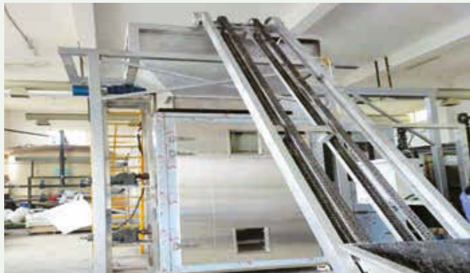
Sludge drying device