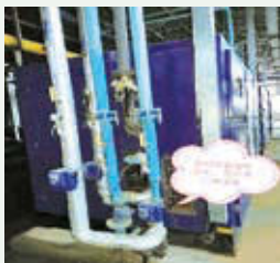
Air compressor residual heat recovery unit

During the Reporting Period, both the Compal Production Plant and the Neijiang Production Plant adopted the residual heat recovery unit of air compressor to heat domestic water and reduce the consumption of electricity and energy. The residual heat recovery of the Compal Production Plant was 745.89 million kcal replacing 455,600 m 3 of natural gas and 553 tons of coal equivalent; the Neijiang Production Plant saved 300,000 m 3 of natural gas and reduced 369 tons of coal equivalent for the whole year.