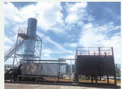
VOCs treatment process