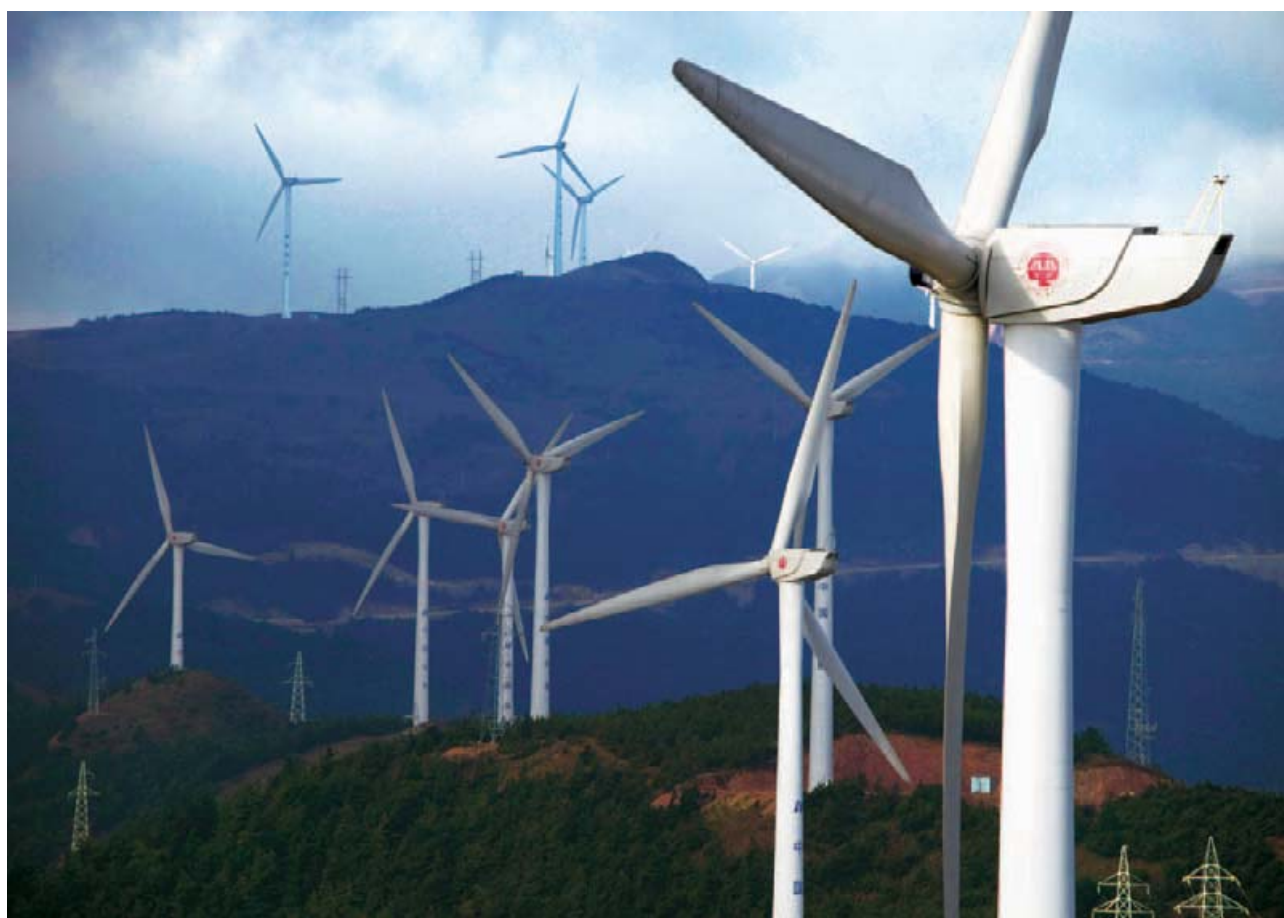
Power Assets' Dali Wind Farm wins a quality project award in Mainland China.

CKI is one of the largest publicly listed infrastructure companies listed on The Stock Exchange of Hong Kong Limited ("SEHK") with diversified investments in energy infrastructure, transportation infrastructure, water infrastructure and infrastructure-related businesses. Operating mainly in six jurisdictions: Hong Kong, the UK, the Mainland, Australia, New Zealand and Canada, it is one of the leading players in the global infrastructure arena.