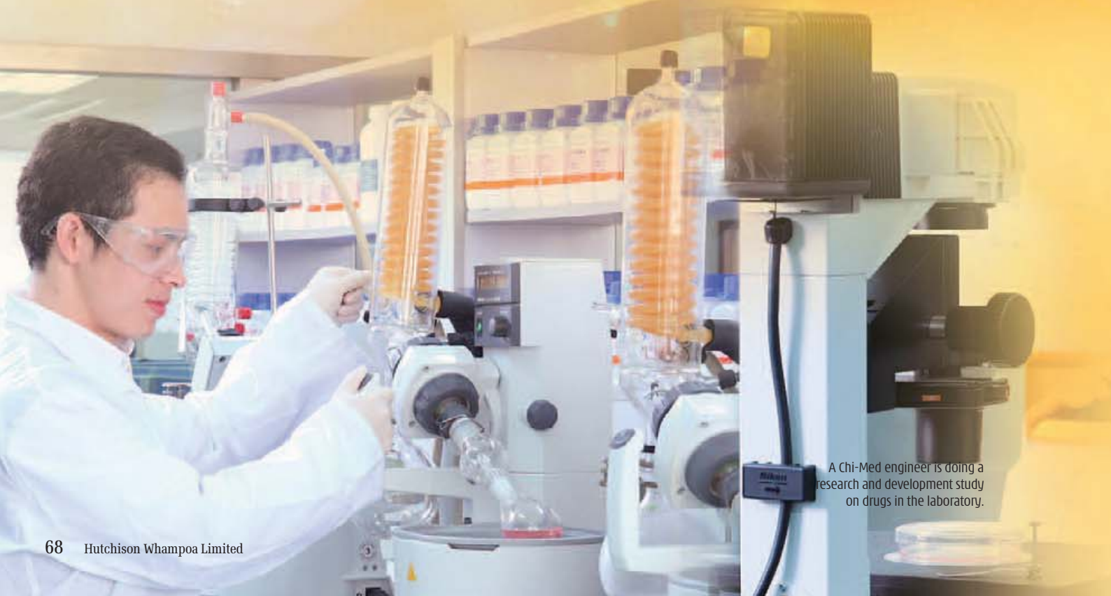
A Chi-Med engineer is doing a research and development study on drugs in the laboratory.

The finance & investments and others division includes returns earned on the Group's holdings of cash and liquid investments, Hutchison Whampoa (China) Limited ("HWCL"), listed subsidiary Hutchison Harbour Ring Limited ("HHR"), listed associate TOM Group ("TOM") and Hutchison Water.