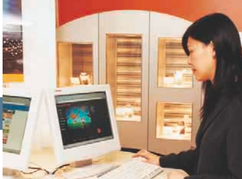
At Hutchison Telecom's flagship store in Macau, customers can access the Internet at the specially designed "Information Corner" and obtain the latest updates on mobile products and services.