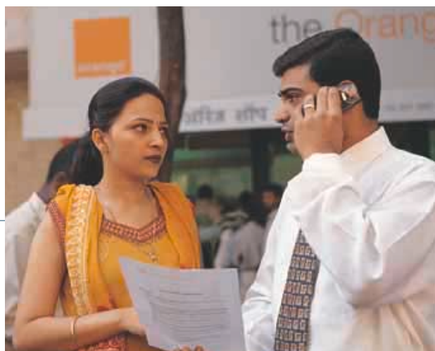
Mobile phones are becoming increasingly popular in India. There are over 6 million subscribers in the country with a growth rate of over 5% a month.

In India, the Group's 2G telecommunications operations consist of 49% interests in four operations: Hutchison Max Telecom in Mumbai, Sterling Cellular in Delhi, Usha Martin Telekom in Kolkata and Fascel in the province of Gujarat. In the second half of 2001, the Group's joint venture with the Essar Group successfully acquired three additional mobile licences, for a total of US$99 million, in the provinces of Karnataka (includes Bangalore city), Andhra Pradesh (includes Hyderabad city) and in the city of Chennai, which are scheduled to commence operations in mid 2002. In this rapidly growing mobile telecommunication market, the four existing operations recorded an impressive 81% growth in their combined subscriber base in the year, which currently totals over 1.2 million and the reported EBIT was almost double that of last year.