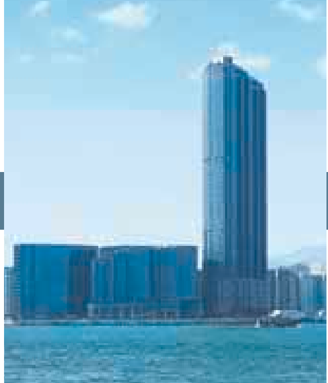
An imposing 72 storey development on the Hunghom waterfront, The Harbourfront Landmark is the highest waterfront residential building in Hong Kong.

There were no material development profits in Hong Kong in 2001 due to the timing of completion of projects. Presales activity commenced during the year for phase one of Caribbean Coast, a multiphase residential and commercial development totalling 4.4 million sq ft at Tung Chung in which the Group has a joint venture interest with a profit sharing arrangement. Construction is on schedule for a phased completion of the development between 2002 and 2005. The Group has made a prudent provision for this project.