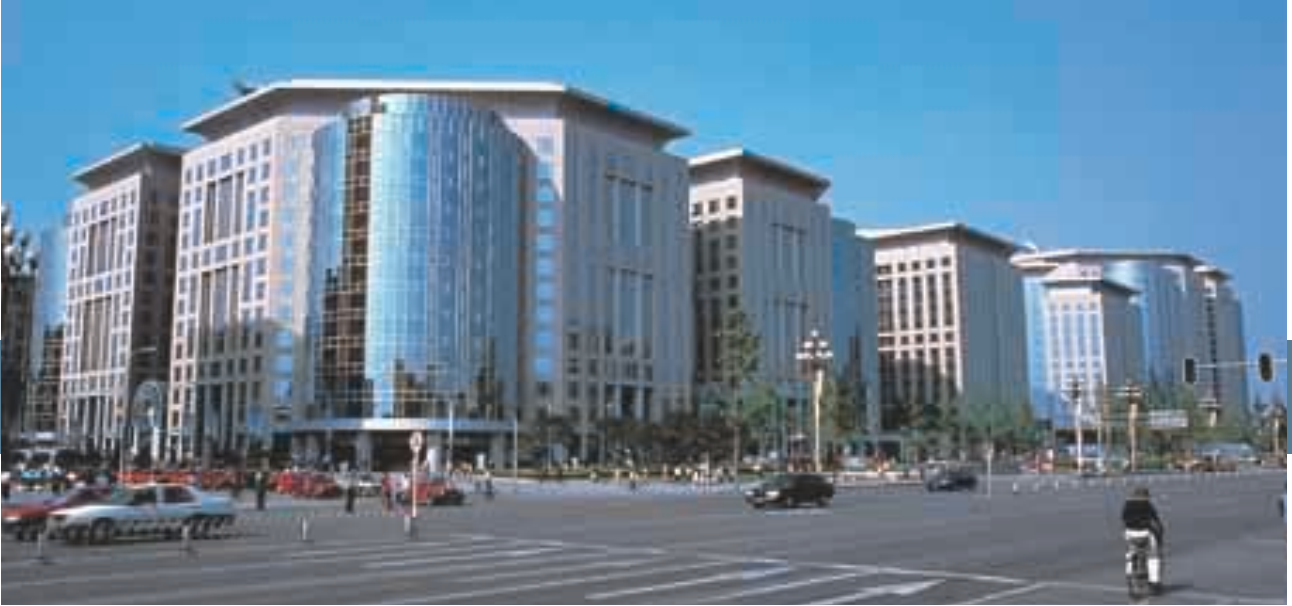
Located in the heart of Beijing, Oriental Plaza is Asia's largest commercial complex.

The Group's hotels in China improved their results, although an overall loss was reported due to start up losses of the two new hotels and continuing strong competition. The Harbour Plaza Beijing (95% interest) reported improved room rates while the Sheraton Great Wall (49.8% interest) reported improved operating results after completing a room renovation programme. The Harbour Plaza Chongqing (50% interest) reported improved occupancy while the Harbour Plaza Kunming (95% interest) reported improved occupancy and room rates. The Times Plaza Shenyang (87.4% interest), a 274 room mid-range hotel, commenced operations in June. The Grand Hyatt Beijing at Oriental Plaza (18% interest), a 591 room and 277 serviced suite premium hotel, commenced operations in October.