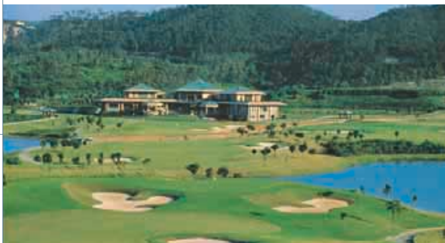
Dongguan Harbour Plaza Golf Club boasts 27 championship holes covering a total site area of 14 million sq ft.

Adjacent to the 27 hole Harbour Plaza Golf Club, in which the Group has a 42% interest, the Group has a 47.3% interest in a 3.4 million sq ft development near Houjie, Dongguan. The next phase of this multiphase deluxe residential housing development, The Lakeside, consists of 864,000 sq ft and is due for completion in 2003. Presale activity has recently commenced.