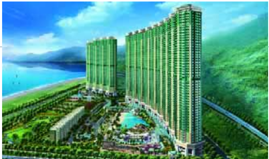
Caribbean Coast is situated in the picturesque Tung Chung new urban centre, close to the Hong Kong International Airport in Chek Lap Kok.