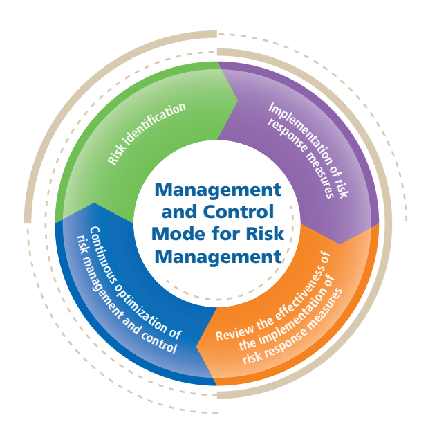
(Figure 2: Management and Control Mode for Risk Management)

During the Year, the management of the Group followed up on the implementation of the risk management improvement measures identified in prior year's risk assessment, as well as establishing a continuous risk management cycle which contains the process of "Risk assessment — Implementation the of the risk management procedures — Follow-up of the implementation of risk management measures — Risk management system ongoing monitoring" in order to ensure that the any risk management gaps are rectified and the ability to prevent and cope with risks is strengthened (for details, please refer to Figure 2: Risk assessment and management model).