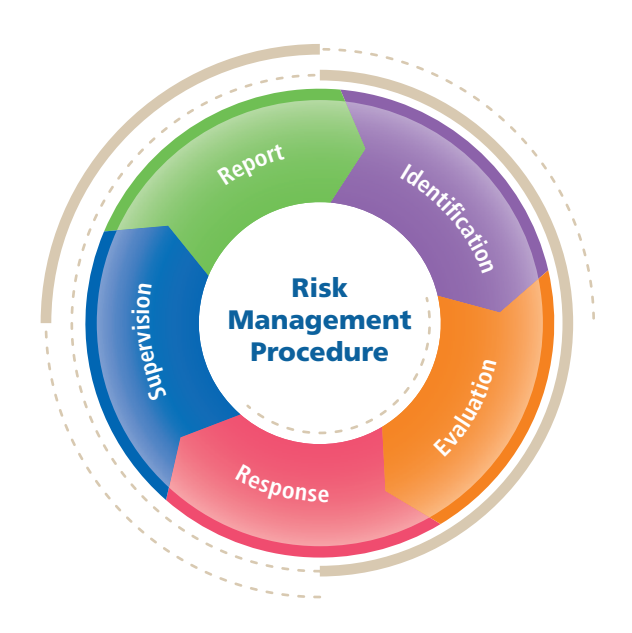
(Figure 1: Risk Management Procedures)