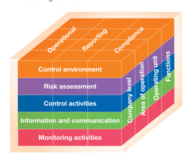
(Figure 3: COSO Internal Control — Integrated Framework)

China Evergrande Group has established its own internal control system by making reference to the internal control framework of the Committee of Sponsoring Organizations of the Treadway Commission (COSO) (please refer to figure 3: COSO Internal Control — Integrated Framework). The Group's risk management system consists of five interdependent elements, which coordinates with each other and operate to ensure the effectiveness of internal control functions of the Group. The five elements are: control environment, risk assessment, control activities, information and communication and monitoring activities.