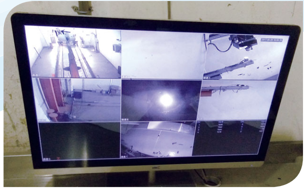
Upper: Camera which can take photos of the inner structure of the product