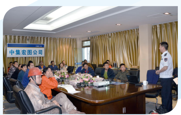
Workshop conducted by the Fire Department

In addition, each business division is required to comply with the Group's Rules on Production Accident Response, focusing on tackling chemical spill, flood, fire, explosion, typhoon, etc., and organising specific drills. In 2016, the Company conducted over 80 emergency drills.