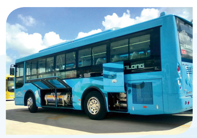
Maintenance service for Zhuhai City Bus

Zhuhai City Bus Co., Ltd ("Zhuhai City Bus") is a major customer of CIMC Sanctum. In August 2016, it requested a maintenance service. A delay in the maintenance work was expected due to insufficient production capacity during the peak season, which would lead to temporary shutdown of relevant bus operation. After the customer service centre received the complaint, our representative did a site visit, proposed the solutions. A Wechat group was formed with staff from Zhuhai City Bus, where they could check the repair status from time to time. The maintenance work only took half the time than originally expected and we have effectively resolved the customer's problems.