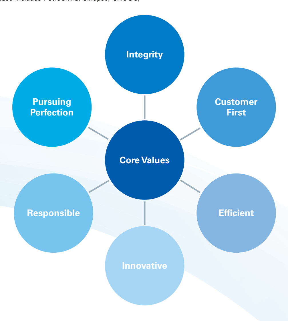
CIMC Enric's Core Values

ENN Energy, Shenzhen Gas, Towngas China, PT PLN (Persero), Cronos, EXSIF, TAL International, Bertschi, Eurotainer, Constellation Brands, Anheuser-Busch InBev, Heineken and Carlsberg etc. By investing in the development of healthy customer relationships, some customers have partnered with the Group to pursue new lines of business or develop new products.