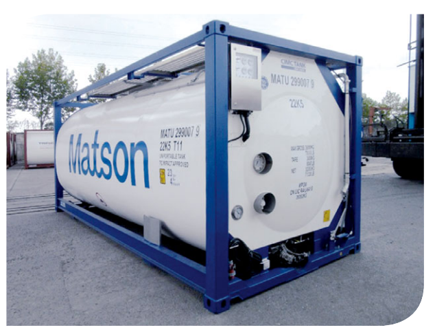
Exhaust gas purification tank

In 2016, the Company upgraded the quality assurance system to a digital system. The monitoring process was connected to computers, mitigating the consumption of developer, fixer and plastic films. This not only improved the efficiency of quality assurance but also greatly reduced the environmental impact.