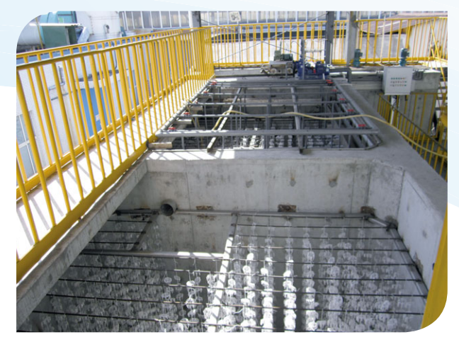
Spray paint effluent treatment facility

For all hazardous and non-hazardous waste, we comply with the Solid Waste Prevention and Control Law of the PRC (《中華人民共和國固體廢物污染環境防治法》) and Notice on Interim Measures on the management of Hazardous Waste in Jiangsu Province (《江蘇省危險廢物管理暫行辦法》), where we commissioned the qualified third party to collect all hazardous waste and report to the Ministry of Environmental Protection (環保局). Non-hazardous waste is handed over to the Environmental Hygiene Department (環衛處) for further treatment.