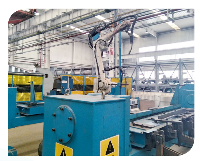
Robot Welding Machine

One of our subsidiaries in Nantong has introduced robot welding machines, which offers a huge advantage over the traditional method. The traditional method requires two workers to perform the welding, whereas the new machine assisted method requires only one worker to operate. The efficiency of the welding procedure has been doubled after replacing of the old machines.