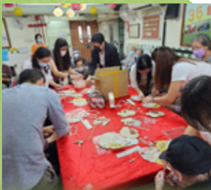
Visiting The Home of the Elderly

Through various outreach programs, charitable activities and partnerships, Saint Honore and Zoff Hong Kong demonstrate their dedication to creating meaningful change and supporting the well-being of the community. Saint Honore proudly received the “15 Years Plus Caring Company Logo” from the Hong Kong Council of Social Service, recognizing our long-standing commitment to corporate social responsibility. Additionally, Zoff Hong Kong was awarded the “5 Year Plus Caring Company Logo,” reaffirming our dedication to fostering a positive impact on the community, supporting our employees and promoting environmental sustainability. These accolades highlight our ongoing efforts to integrate social and environmental responsibility into our business operations, aligning with our broader ESG commitments.