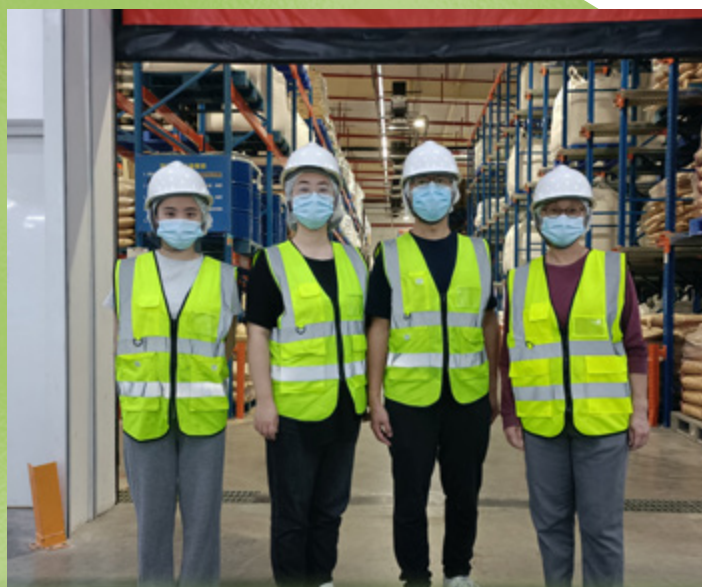
Our Vendor Compliance Team

For more details of our efforts in engaging suppliers and safeguarding food safety, please refer to pages 19 to 22 and pages 25 to 27.