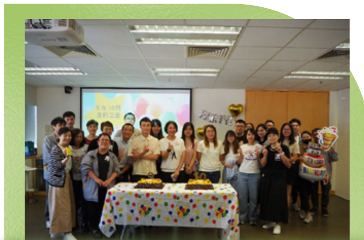
Bi-monthly birthday party

Besides, the Social Team plays a key role in fostering employee engagement through the annual HEARTS program. This program encompasses initiatives such as career development sessions, work-life balance workshops and social gatherings. These efforts align with our commitment to employee well-being, professional growth and the cultivation of a supportive and collaborative workplace culture.