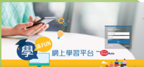
Our e-learning platform

In addition to these structured programs, CRA offered e-learning courses and corporate training sessions throughout the year, ensuring accessibility and flexibility in employment development. By prioritizing professional growth, CRA strengthens its workforce capabilities and empowers employees to contribute meaningfully to the company's success. These initiatives underscore our commitment to employee well-being, talent development, and operational excellence as part of our broader ESG strategy.