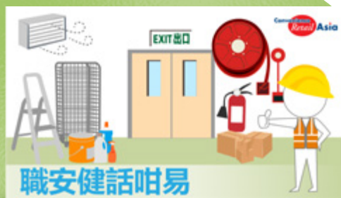
Our workplace safety e-learning programme