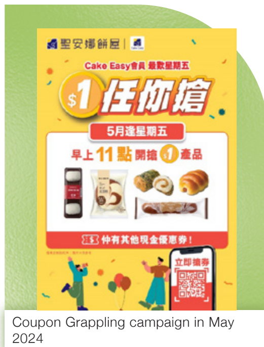
Coupon Grappling campaign in May 2024

Furthermore, sensitive information is encrypted to bolster protection against unauthorised access. Employees are required to adhere to the Code of Conduct and Business Ethics, which outlines guidelines for handling and securing customer information. This proactive approach not only safeguards customer privacy but also underscores our unwavering commitment to data security. During the reporting year, there were no incidents concerning the protection of customer information.