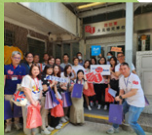
Visiting the elderly in Tai Yuen Estate