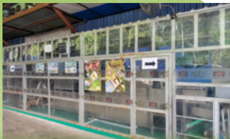
Audit of Durian Paste Factory in Malaysia