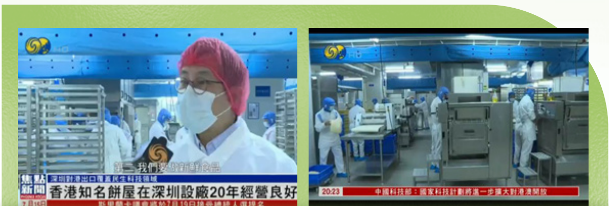
External Food Safety Promotions and Communications

By combining thorough audits with proactive communication and assessment, CRA ensures that its supply chain operates responsibly, ethically and in alignment with our mission to deliver safe, high-quality products. This approach reinforces our dedication to operational excellence and sustainability, fostering trust and confidence among our stakeholders.