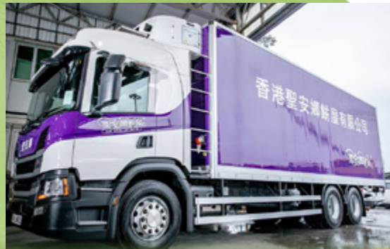
Gradually transforming our in-house logistics team with EURO VI trucks