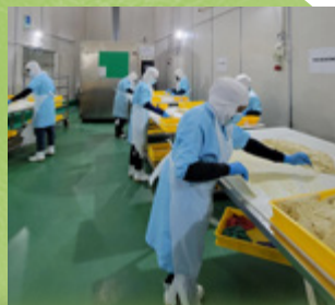
Inspecting the process of selecting impurities from durian meat of a Malaysian supplier