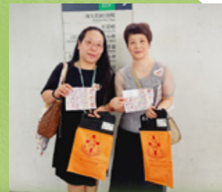
Tung Wah Group of Hospitals Flag Day 2024