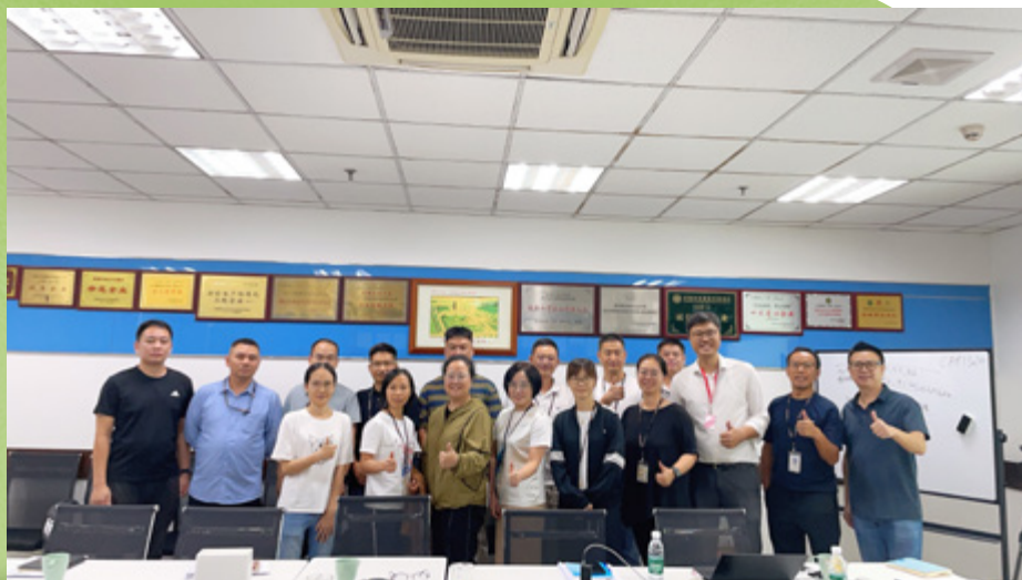
Middle Management Team from R&D, Purchasing, Planning, Production, QA, Warehouse and Engineering departments

To pursue good food safety management practices in our factories, implementation roles and responsibilities have been strategically assigned to the existing factory personnel, leveraging their expertise and familiarity with operational processes. These dedicated efforts are focused on meticulously developing and refining the food safety management system, with the ultimate objective of complying with the most stringent food safety standard in near future. This initiative underscores the factory's unwavering dedication to upholding global food safety standards and delivering high-quality, safe products to its stakeholders.