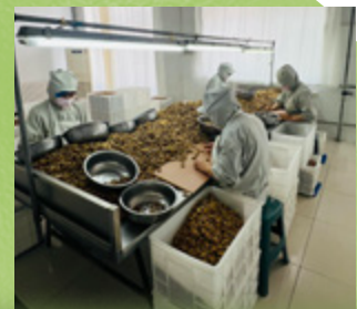
Inspecting the walnut selection process in Fenyang, Shanxi