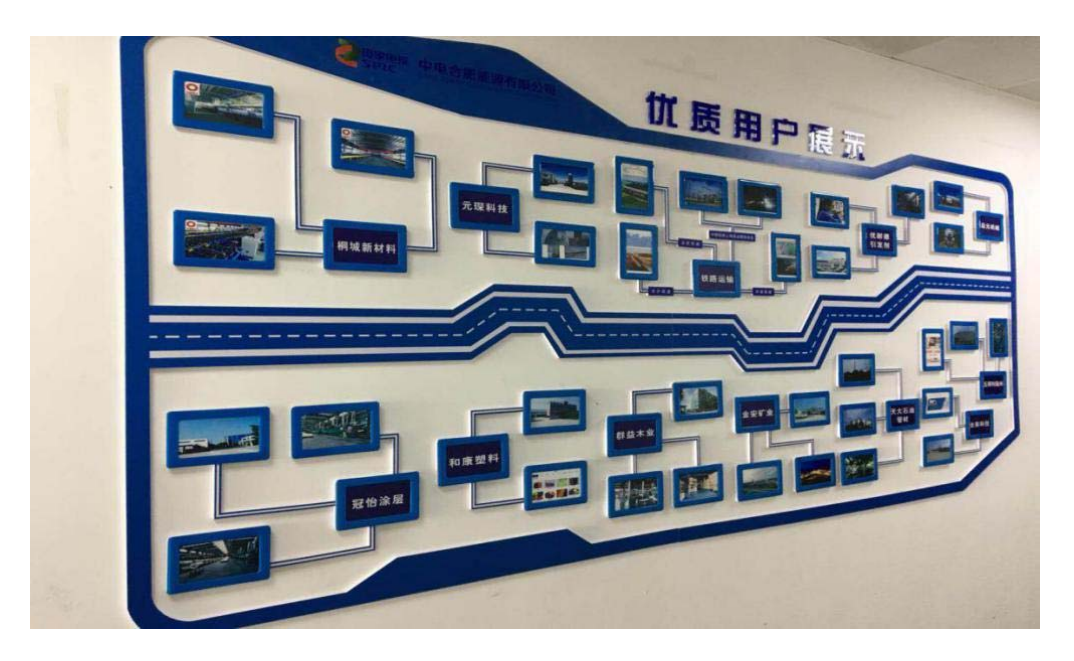
Brand wall illustrating the electricity sales service series for users in Pingwei

Adhering to the marketing principle of "customers are the king", the company endeavors to bring the best service to users with a view to solving problems for them