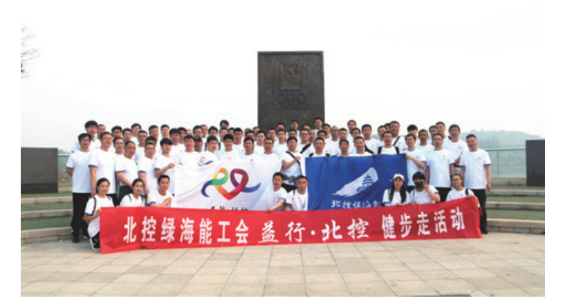
2018 Beikong Lvhaineng Labour Union Yi Xing • Beijing Enterprises Health Walk Event (2018北控線海能工會益行 • 北控健步走括動)

Note: Training hours per session x total number of participants