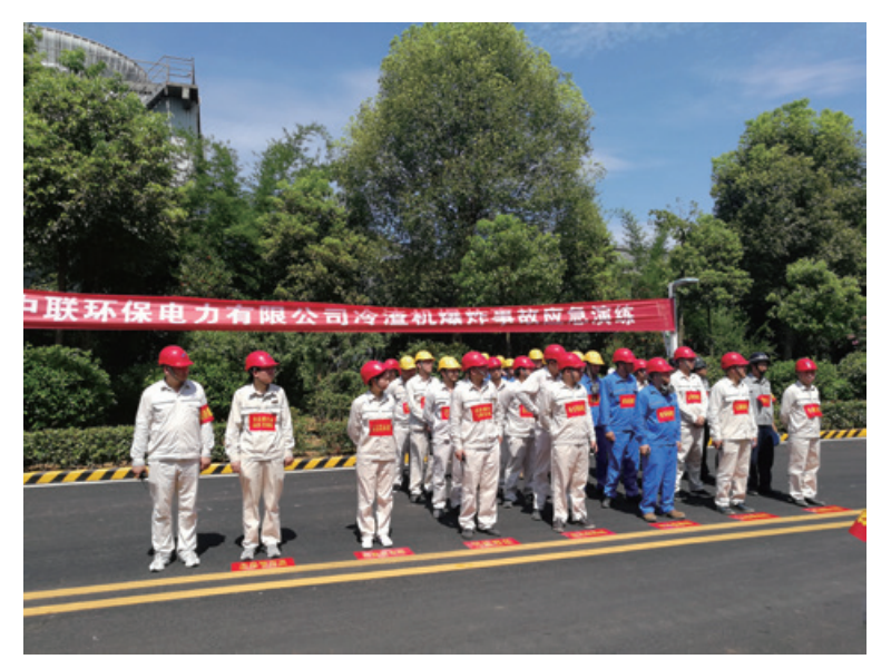
Explosive accident emergency exercise

The Group has upheld "safe development", and adhered to the principle of "putting safety first via early prevention as well as comprehensive rectification". It has improved the three-level network for safety management, implemented safe production responsibility system, and carried out comprehensive safe production management to uplift the overall on-site management level. With a special focus on safety training, the Group aims to strengthen the safety awareness among all staff. It has also carried out regular, ad hoc and, seasonal equipment debugging and renovating works to eliminate unsafe behaviour of employees, unsafe conditions of objects, and unsafe environmental factors. During the whole year, there have been no major fires, equipment damage, serious injuries, or serious environmental pollution. Hunan Changde Project has been rated as the "Safe Production Advanced Unit" by the safety supervision department of Changde Economic and Technological Development Zone for consecutive six years, and has been granted the title of "Fire Safety Advanced Unit" at the municipal level for several times. Shandong Taian Project was awarded the qualification of the secondary enterprise of power safety production standardization and the honorary title of "Safe Production Advanced Unit" in Shandong Province.