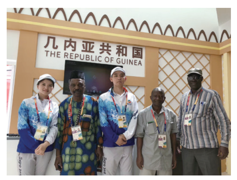
Beijing World Horticultural Exposition Voluntary Activities (北京世園會志願者活動)

Note: Training hours per session x total number of participants