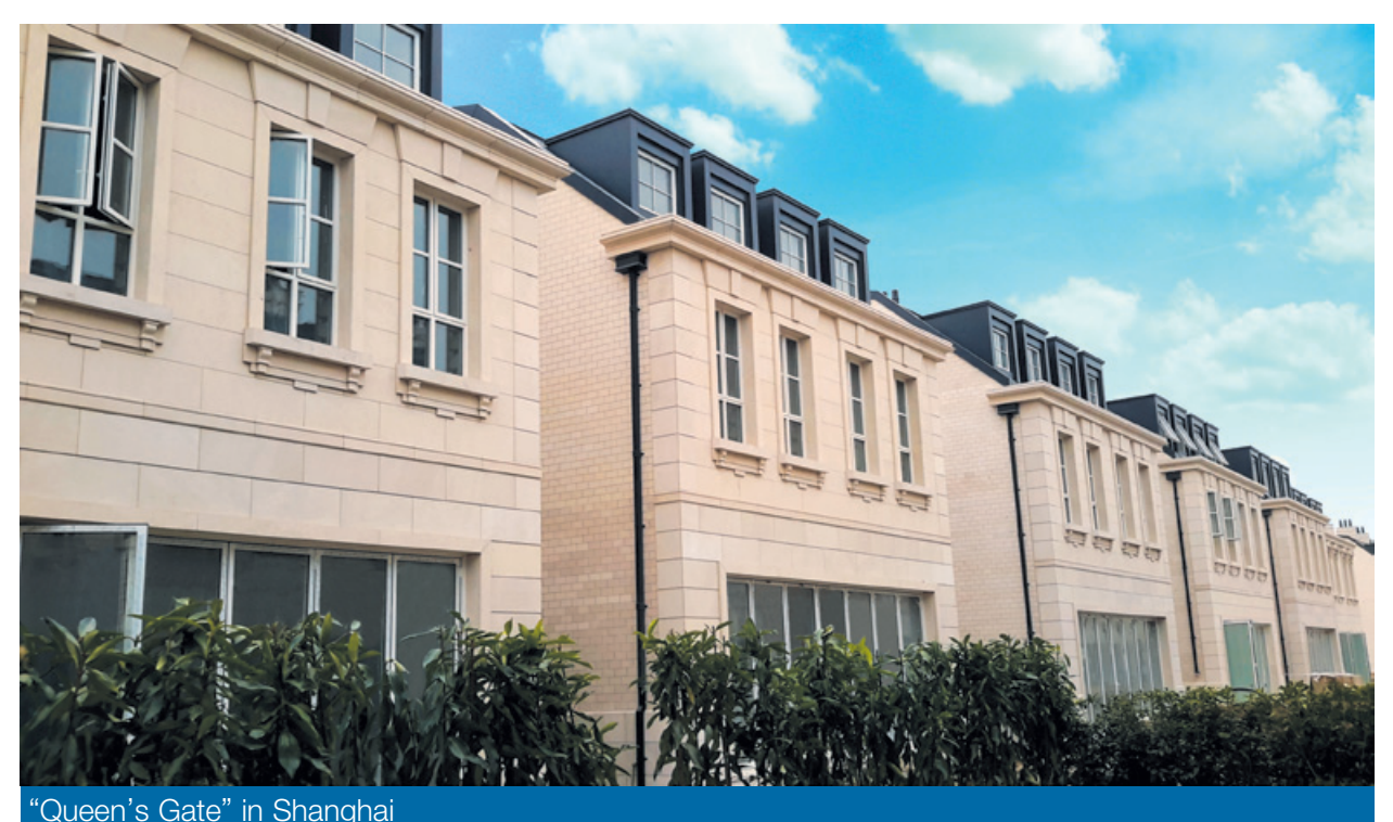
Quoon o dato in oi