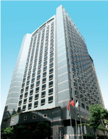
Empire Hotel Hong Kong