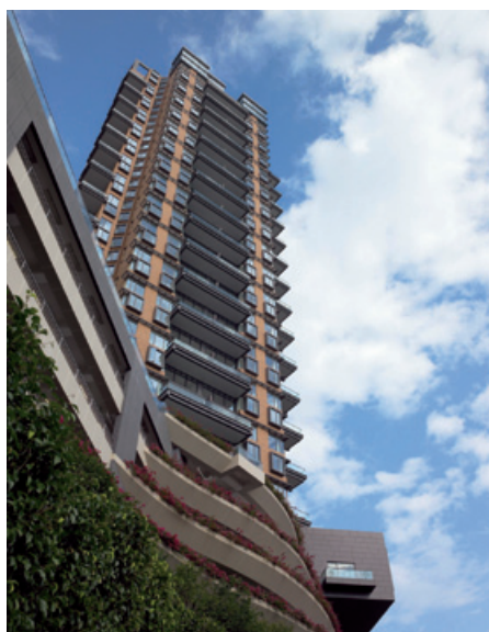
The Westminster Terrace