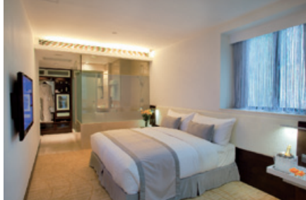
Empire Hotel Causeway Bay