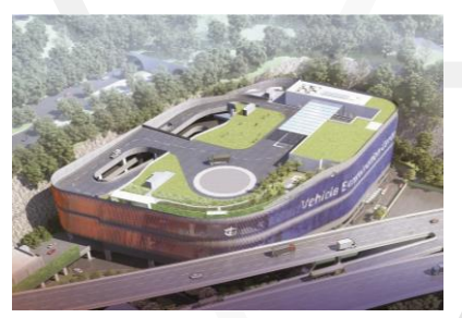
Tsing Yi Vehicle Examination Centre

Design and installation of BMS and ELV system for office development