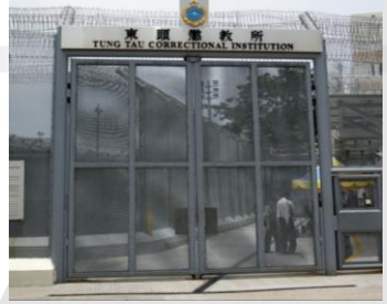
Tung Tau Correctional Institution

Supply & installation of Vehicle Examination Equipment and Related Electronics and Control System (VEES)