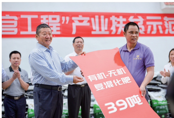
On May 22, 2018, Ping An began to implement the Three-Village Project in Guangxi to develop poor remote areas.

Project in answer to the state’s call to fight poverty. By means of technologies, we replicate smart city models in poor areas for “smart poverty alleviation”. In the first half of 2018, the Three-Village Project was implemented in four provinces and municipalities such as Guangxi.