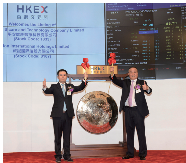
On May 4, 2018, Ping An Healthcare and Technology Co., Ltd. (Ping An Good Doctor, 01833.HK) was successfully listed on the HKEX.

This year marks the 40th anniversary of China’s reform and opening-up. Ping An’s success in the past 30 years is attributable to the opportunities from China’s reform and opening-up as well as the support from shareholders and customers. We launched the Three-Village