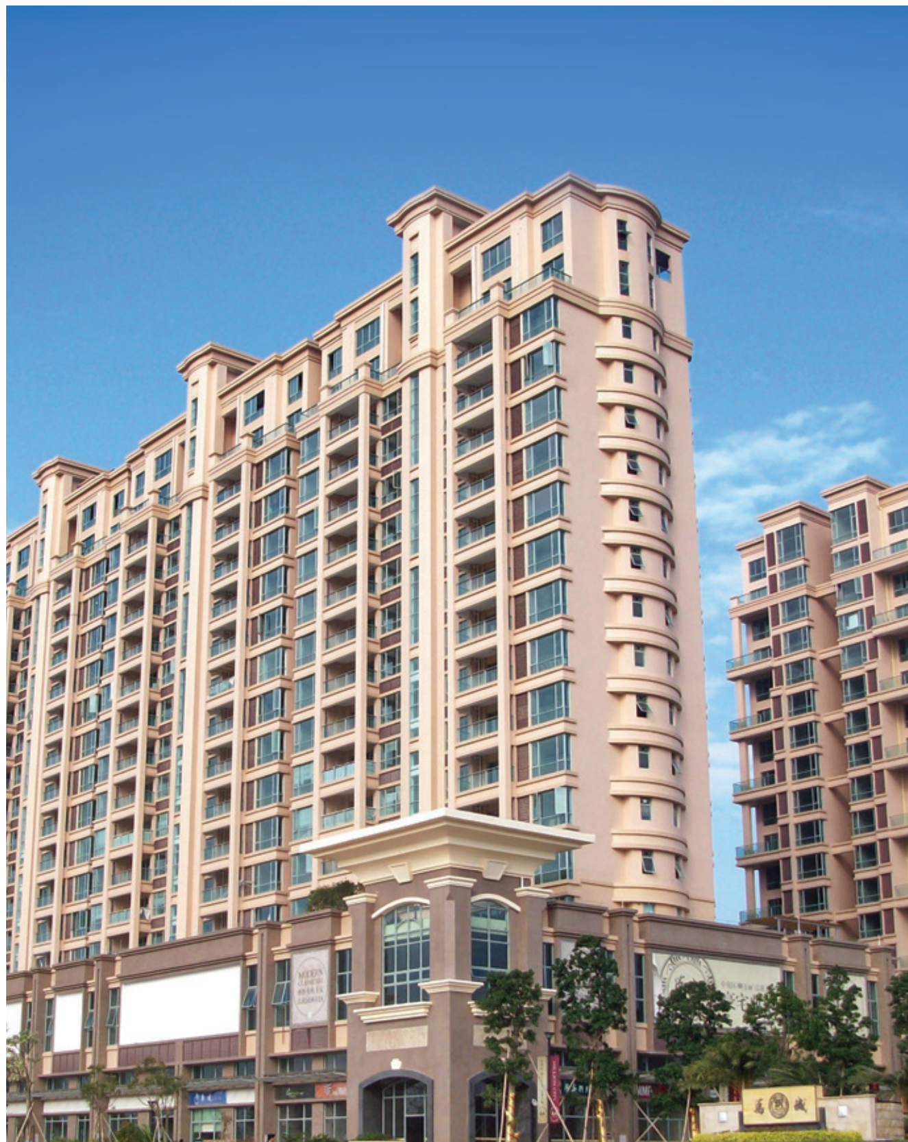
Million Cities International 萬城國際