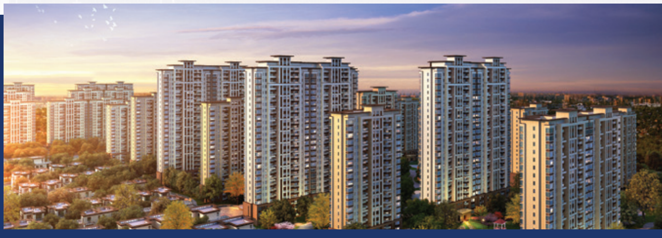
Dragon Palace 聚瓏灣