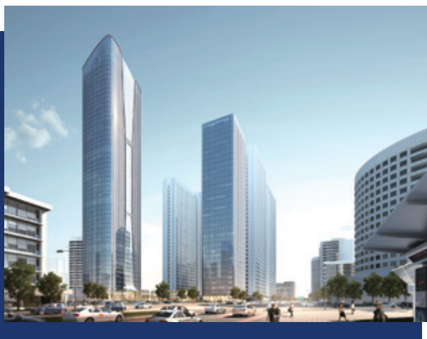
Million Cities Tonghu Centre 萬城潼湖中心