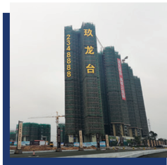
Dragon Terrace 玖龍台

毛利由截至2017年12月31日止年度的約人民幣205.4百萬元增加約人民幣57.4百萬元或27.9%至截至2018年12月31日止年度的約人民幣262.8百萬元。毛利率由截至2017年12月31日止年度的約21.1%增至截至2018年12月31日止年度的約46.3%。毛利及毛利率增加主要是由於已售每平方米平均售價增加。由於中國物業市場於過去幾年蓬勃發展，截至2018年12月31日止年度已售物業售價普遍高於往年。毛利及毛利率增加亦是由於已售每平方米平均銷售成本下降。除上文所述者外，上述已售每平方米平均售價及每平方米平均銷售成本變動，亦是由於截至2018年及2017年12月31日止年度已售物業類型佔比不同所致。截至2017年12月31日止年度的收入來自本集團以下兩處物業的銷售：(i)天津萬城聚豪一期及二期；及(ii)廣東省惠州萬城名座一期及陽光新苑二期，而截至2018年12月31日止年度的收入主要來自本集團於惠州的物業銷售，包括萬城名座二期、陽光新苑一期及皇冠豪苑。由於(i)天津發展項目的發展成本及土地收購成本高於惠州；(ii)本集團以較低利潤的定價策略銷售萬城聚豪一期及二期(本集團於天津的首個項目)，以吸引更多客戶及擴展本集團於天津的版圖，故萬城聚豪一期及二期的毛利率普遍低於本集團惠州的大部分物業。