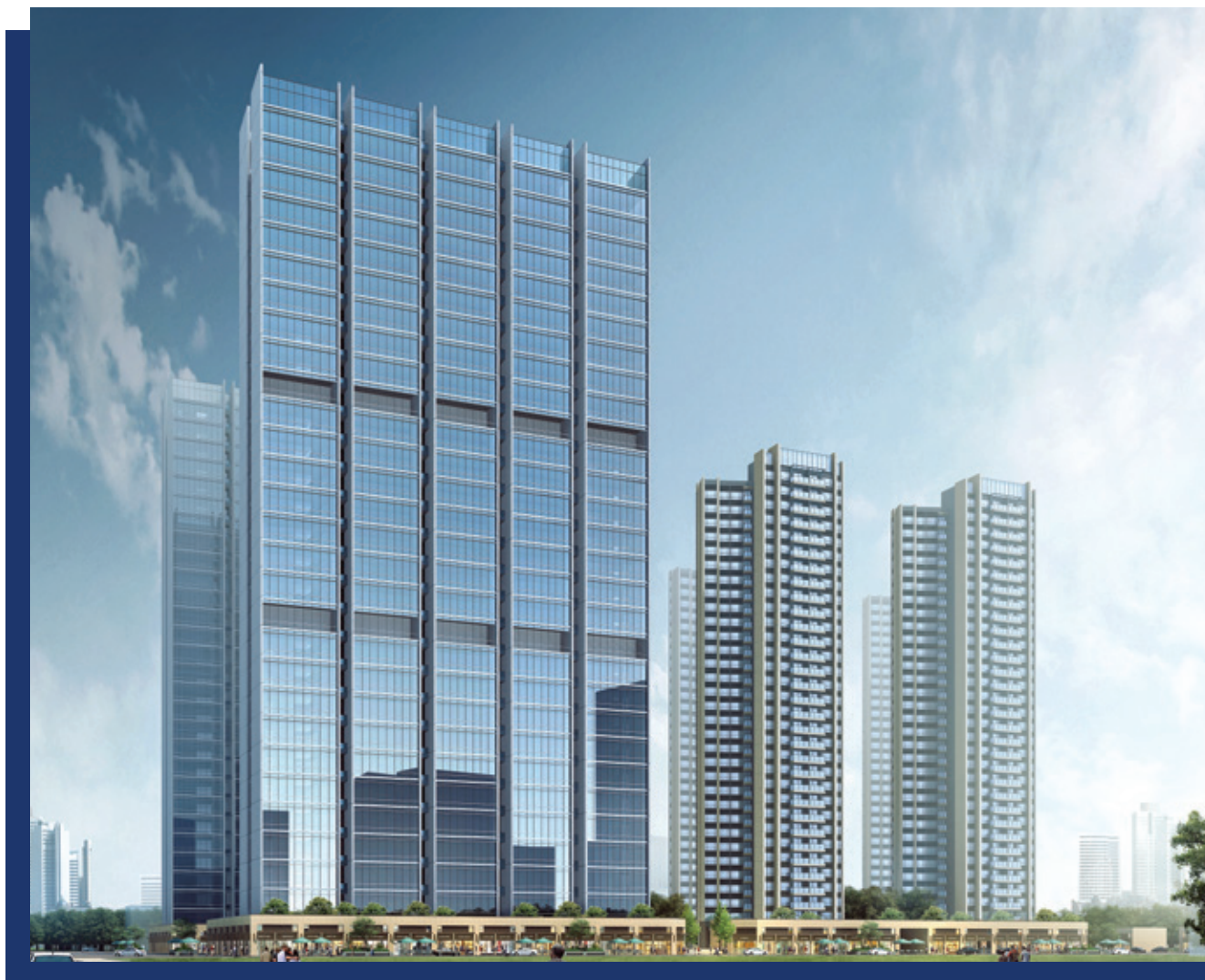
Dragon Terrace Phase 2 玖龍台二期

本集團萬城名座二期及皇冠豪苑等發展項目已先後於2018年1月及5月開始預售。截至2018年12月31日，已分別預售總建築面積（「建築面積」）合共約109,000平方米及24,000平方米（按銷售認購書的建築面積計），分別佔該等發展項目可售總建築面積的約95.6%及76.5%。萬城聚豪四期及由本集團聯營公司持有的聚瓏灣一期已於2018年9月開始預售。截至2018年12月31日，已分別預售總建築面積合共約49,000平方米及40,000平方米（按銷售認購書的建築面積計），分別佔該等發展項目可售總建築面積的約99.5%及79.3%。