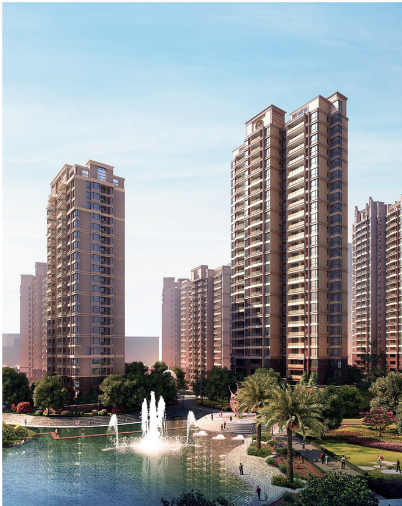
Million Cities Legend 萬城名座