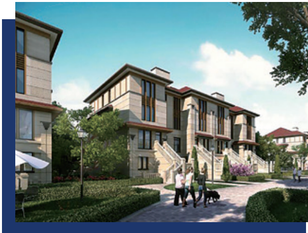
Million Cities Tycoon Place 萬城聚豪