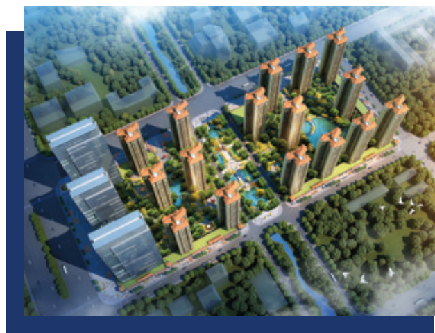
Dragon Terrace 玖龍台