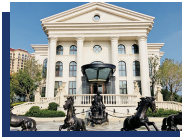
Million Cities Tycoon Place 萬城聚豪

於2018年12月31日，本集團的現金及現金等價物約人民幣1,106.4百萬元，以港元(「港元」)(18.4%)及人民幣(「人民幣」)(81.6%)計值。