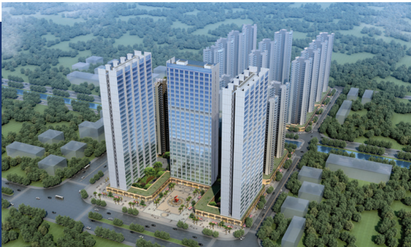
Dragon Terrace 玖龍台