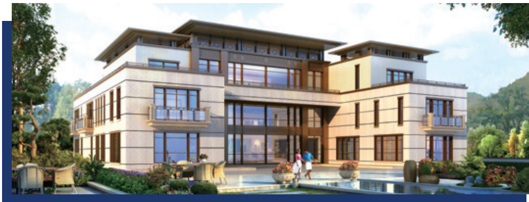
Crown Grand Court 皇冠豪苑