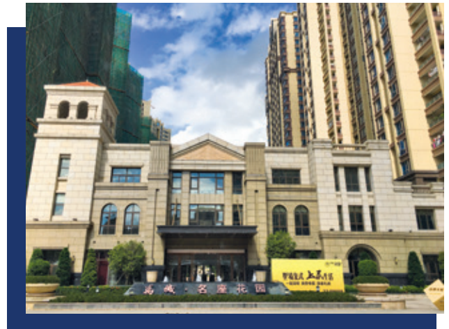
Million Cities Legend 萬城名座