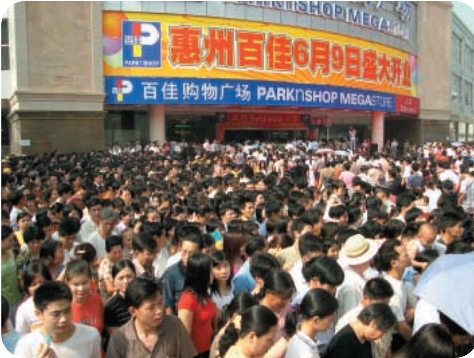
● PARKnSHOP's Megastore in Huizhou, China, provides an unrivalled range of products at the best value for money in a "one-stop" shopping environment.

3,400 retail outlets in the UK, the Netherlands, Belgium, Luxembourg, the Czech Republic, Poland, Hungary, Germany, Latvia and Lithuania. In January this year, the Group announced a cash offer of €534 million for the French listed health and beauty retailer, Marionnaud Parfumeries, one of the largest perfumery and cosmetic retailers in France with 1,226 stores in 15 countries, mainly in Europe.