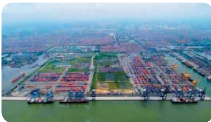
● An aerial view of Jakarta International Container Terminal (right) and Koja Container Terminal (left). Both terminals are strategically located in the industrial heartland of West Java, Indonesia.

In Pakistan, Karachi International Container Terminal ("KICT") reported throughput growth of 10% and EBIT