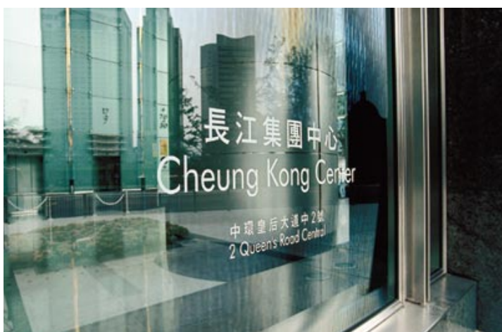
Cheung Kong Center houses the headquarters of Cheung Kong (Holdings) Limited and some of the world's most renowned banks, financial institutions, accounting and law firms.