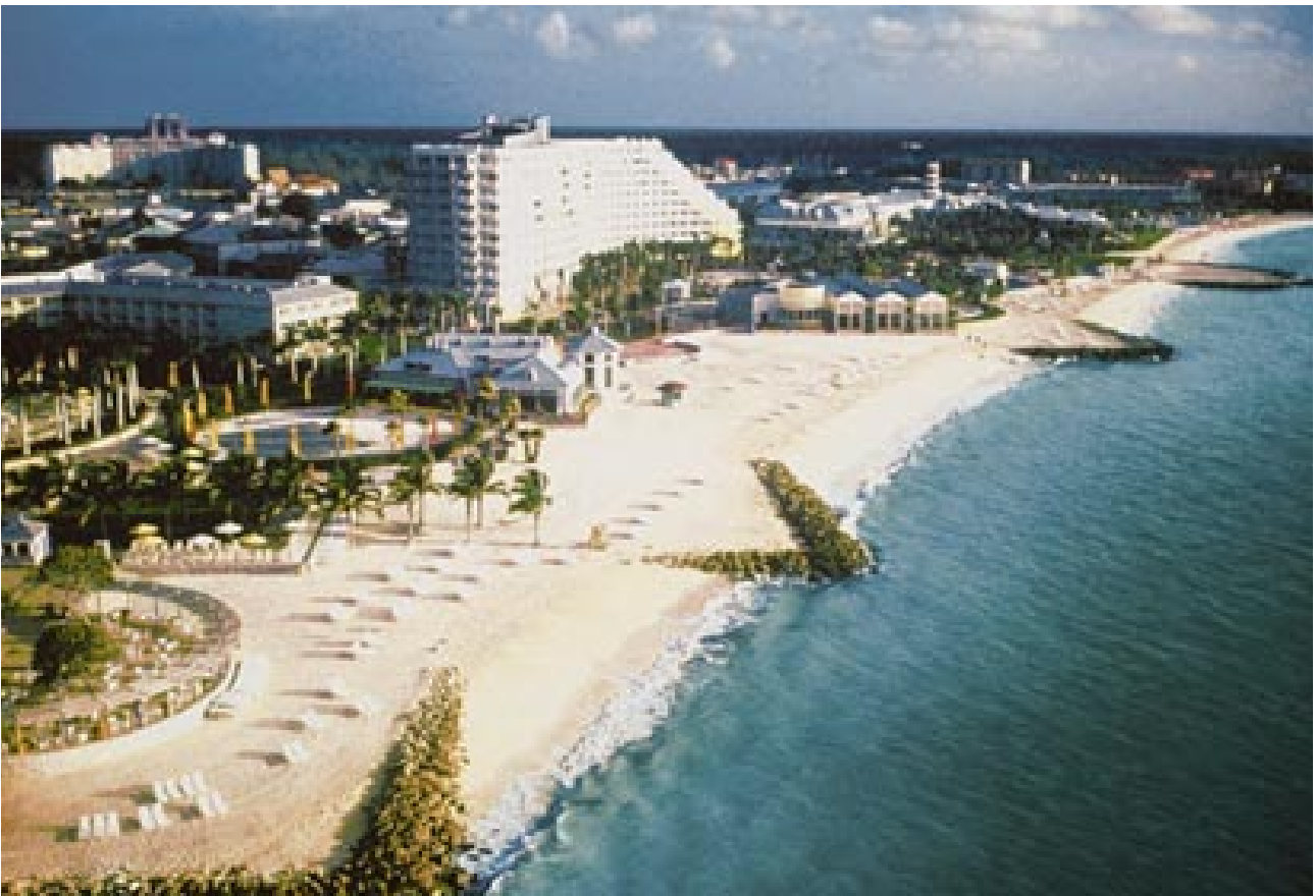
Our Lucaya Beach & Golf Resort located on the pristine white sands of the Grand Bahama Island, proves a luxurious escape for leisure travellers the world over.

Our Lucaya, the 1,271 room hotel and golf resort on Grand Bahama Island, continued to be affected by the low volume of tourist arrivals, particularly from the USA. Earlier this year, Starwood Hotels & Resorts, a USA based, world leading hotel and leisure company, commenced management of this hotel and resort.