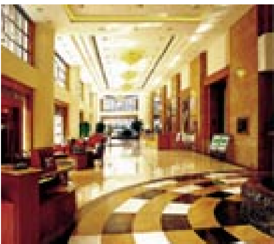
Opened in June 1998, the 391-room deluxe Harbour Plaza Chongqing stands as the original five-star hotel in the city.