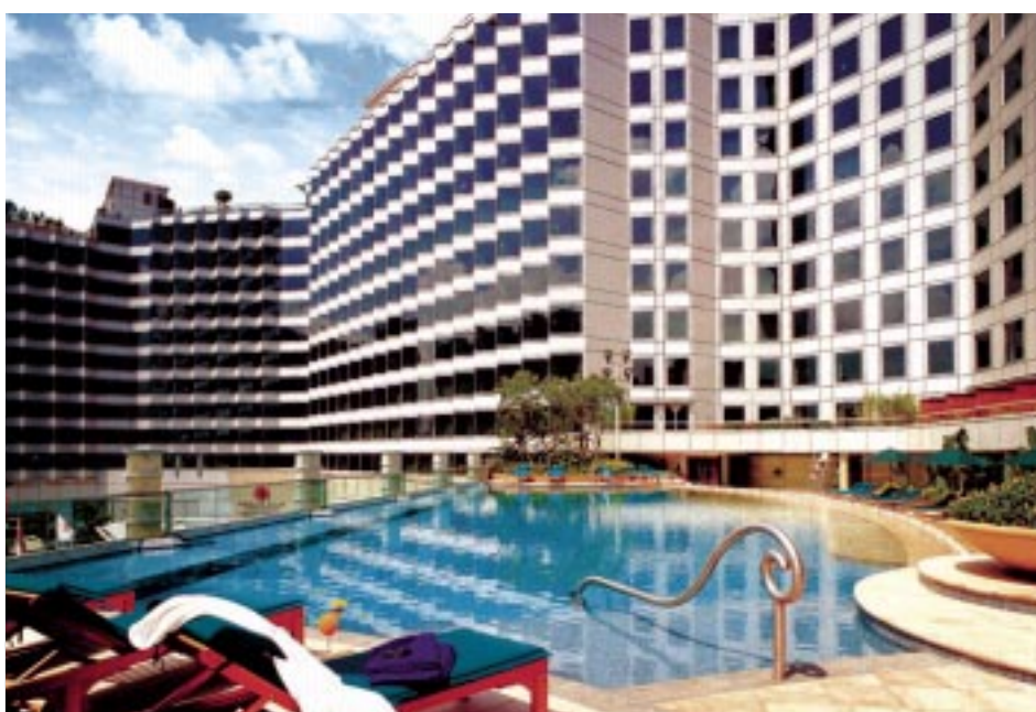
Harbour Plaza Metropolis, the Group's newest hotel property, provides convenient respite at the doorstep of Hong Kong's Hung Hom railway station.