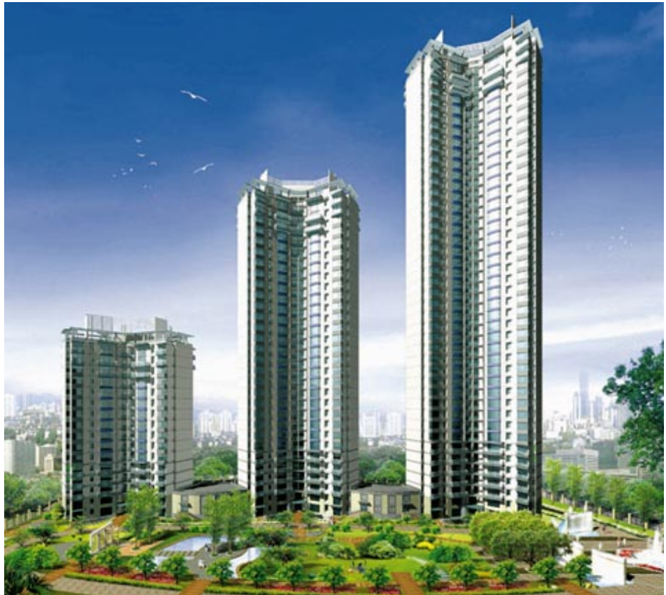
An artist's impression of the medium rise blocks and landscape of The Summit. Providing a gross floor area of 675,000 sq ft, The Summit is Shanghai's premier living space for the elite.

During the first half of the year, the Group increased its landbank in the Mainland by entering into a joint venture to develop a 1.2 million sq ft residential project in the Baoan district, Shenzhen (50% interest). Currently the Group's joint venture share of landbank being developed totals approximately 16.0 million sq ft of developed area, of which 21% is in Hong Kong, 72% is in the Mainland and 7% is overseas. These projects are scheduled for completion in phases from 2003 to 2009 and are expected to provide satisfactory returns and development profits to the Group.