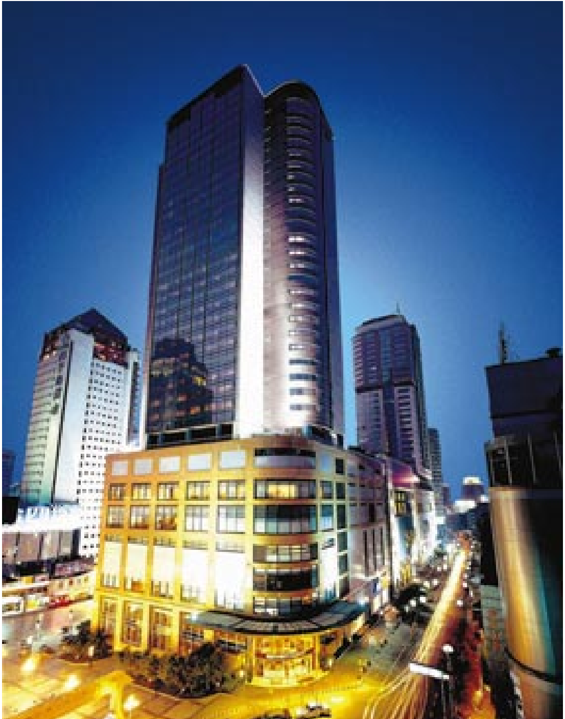
Chongqing Metropolitan Plaza consists of three main operations: a large scale shopping mall, a grade A office tower and a five-star hotel.