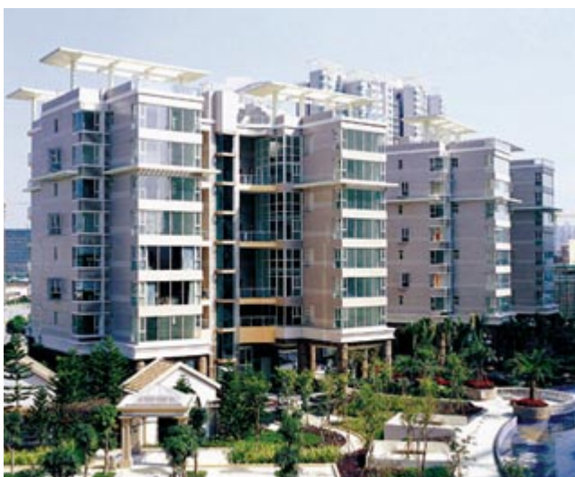
Conveniently located in Shenzhen Central District, Le Parc Phase II is a residential paradise offering an array of contemporary and spacious apartments.