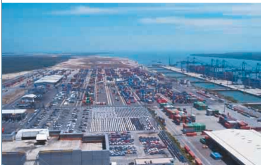
KMT-Westport, Port Klang, is equipped to handle containers, dry bulk, liquid bulk and conventional cargo.

In Malaysia, KMT-Westport (31.5% interest), which was acquired in September 2000, reported an annualised throughput increase of 39% and a commensurate increase in EBIT.