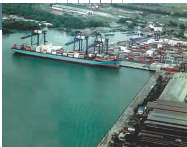
The Port of Balboa serves the trans-Pacific trades.