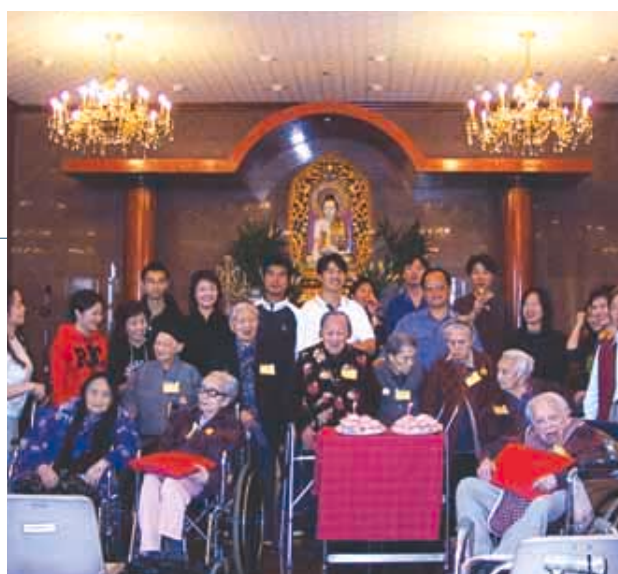
The HWL Volunteer Team makes regular visits to charity groups.

The Group's results for 2001 were achieved in a year characterised by slow economies in Hong Kong and Southeast Asia, a decrease in global import and export activity, and the rapid decline of interest rates led by the USA's economic policy decisions. In addition, 2001 was the second consecutive year of volatile and declining equity markets, particularly in the telecommunications sector. In this challenging environment, the Group performed well and reported improved results from its recurring operations as well as profits from its timely disposal of its investment in VoiceStream.