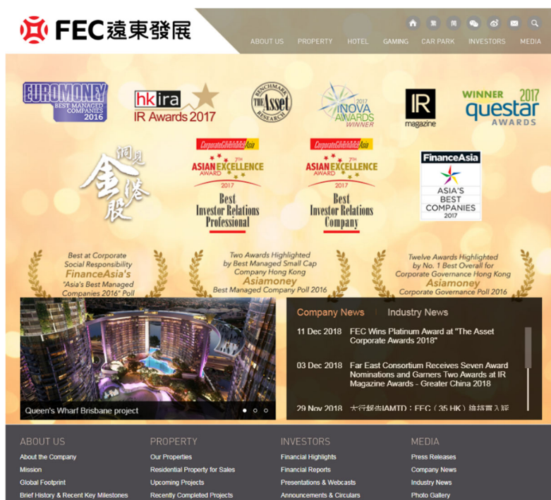
Photo caption: FEC’s official website ( http://www.fecil.com.hk/en/global/home.php )

Photo caption: FEC garnered the Gold Award in the “Investor Relations” section of “Redesign/Relaunch” category, Silver Award in the “Real Estate” section of “Corporate Websites” category and Bronze Award in the “Conglomerate” section of “Online Annual Reports” category in the iNOVA Awards 2018.