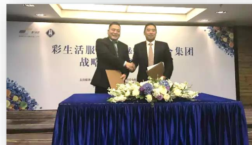
Colour Life Services Group Co., Limited signed a strategic cooperative agreement with China Real Estate Development Union Investments