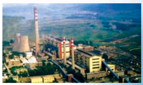
China Power Qinghe Company